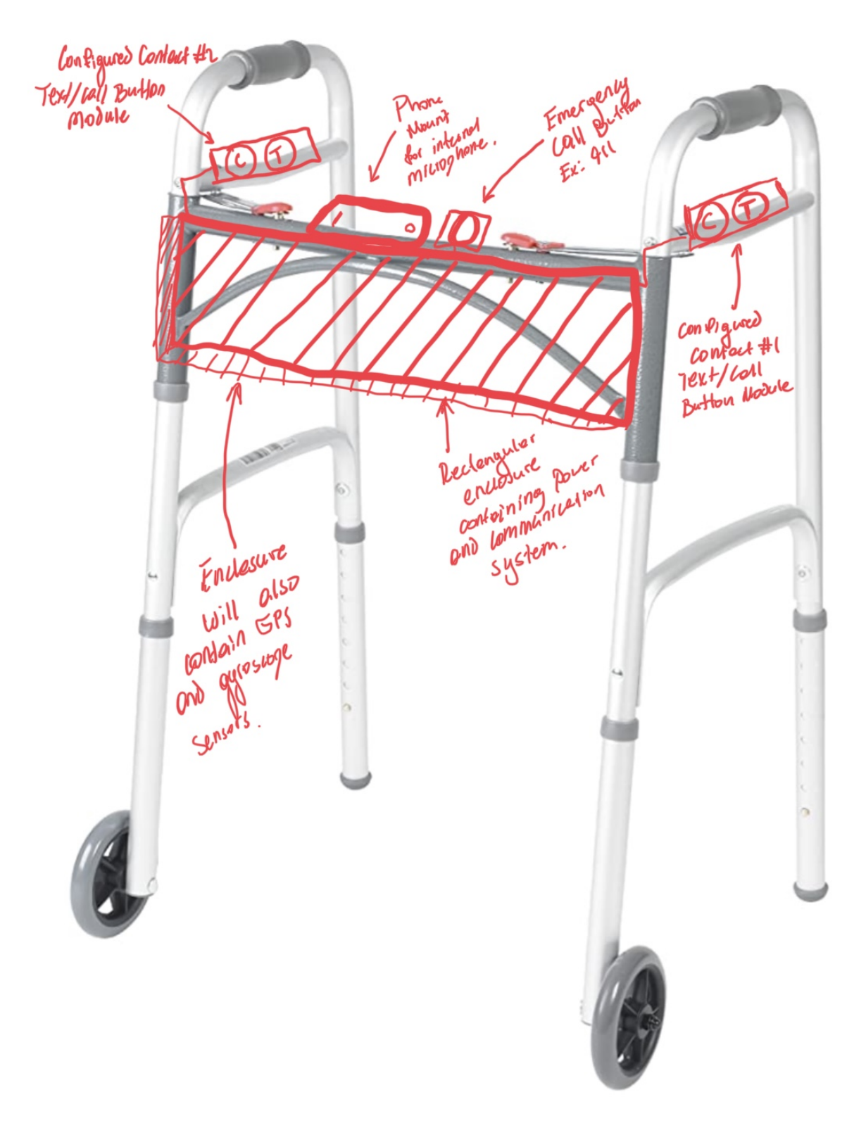
Figure 1: Bluetooth Enabled eWalker Visual