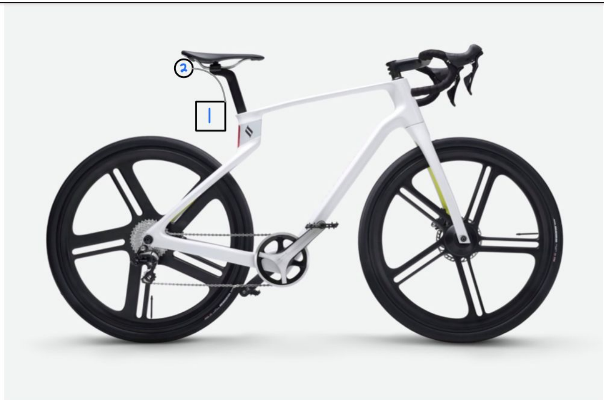
Figure 1: Device Location