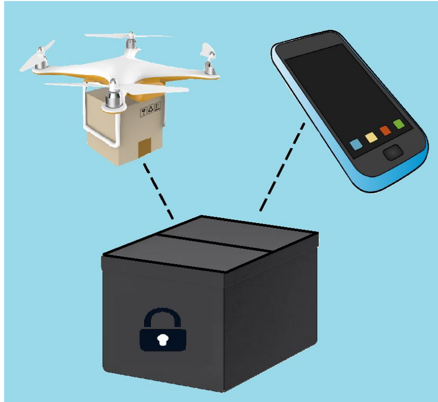
Figure 1: Physical Design