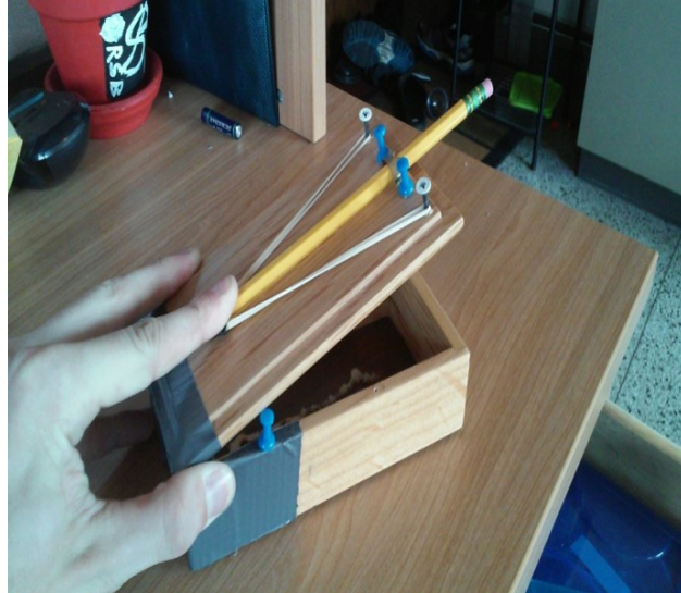
Figure 1: Not a ping pong ball launcher.